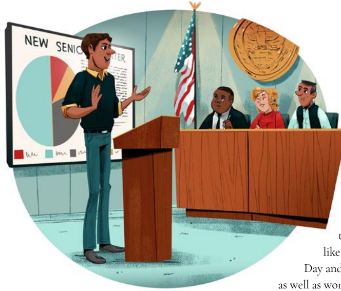
Illustration by Bart Browne

party down the block is running late and loud. "Understanding Conflict Resolution," a Level 3 project in the Persuasive Influence path, will help you make your points with clarity and ease tensions. Also valuable are "Resolving Conflict" and "Communication and Conflict," two Toastmasters brochures available in the Toastmasters Online Store.